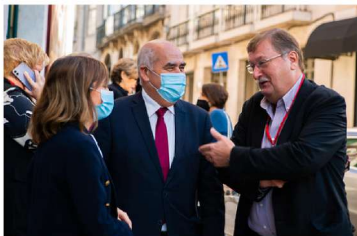
Midterm Conference of ETUC 11.2021