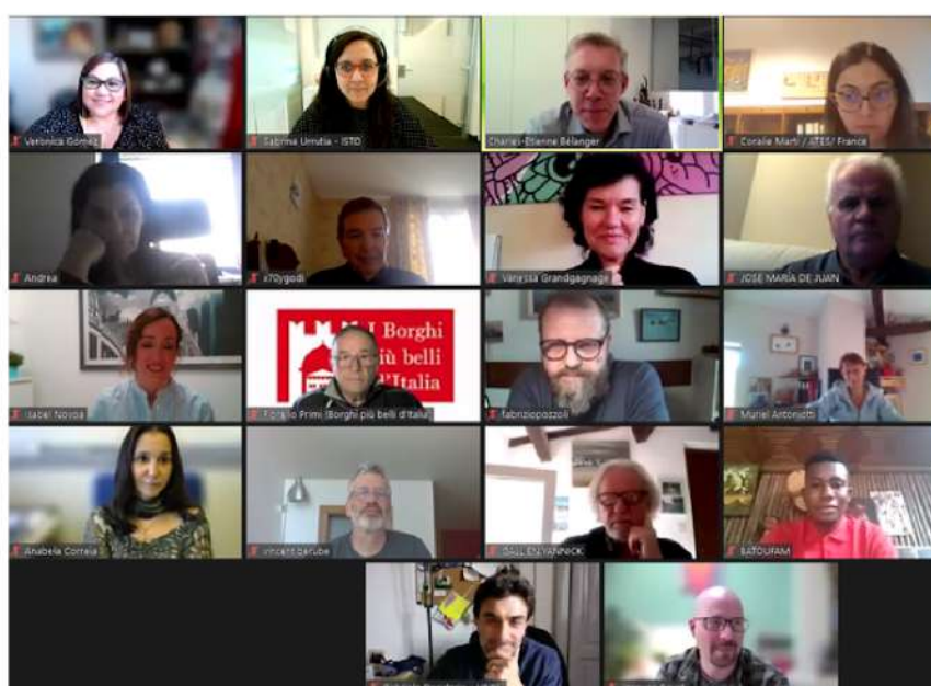
Board of Directors 03.2022