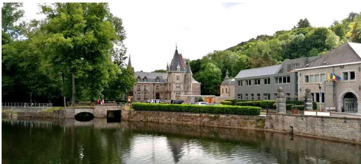
Viroinval, Wallonia, Belgium.