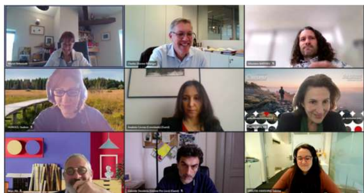
Coordination Council ISTO Europe 04.2022

ISTO Europe's Coordination Council has met twice since ISTO's last General Assembly - once on 04.10.2021, at the Lyon Forum; and a second time on 08.04.2022, virtually.