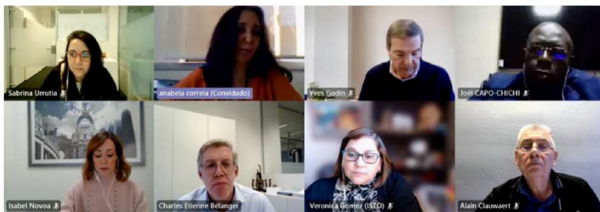
Executive Committee 01.2022