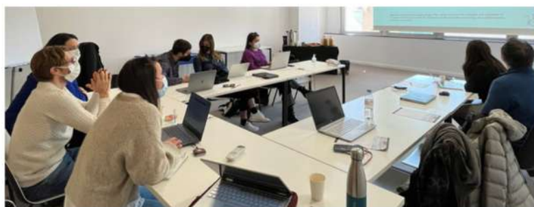
Kick-off meeting 03.2022

In the coming months, ISTO will share information about the development of this project and interested members will be invited to play an active role.