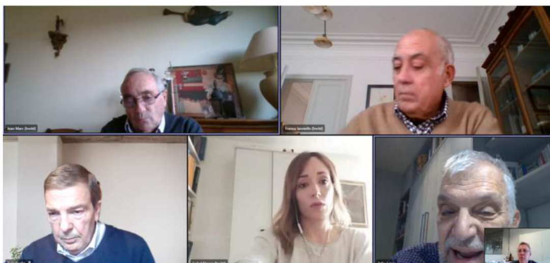
Conseil des Sages 10.2021